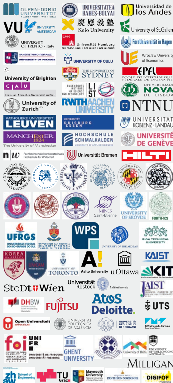
A selection from previous editions.